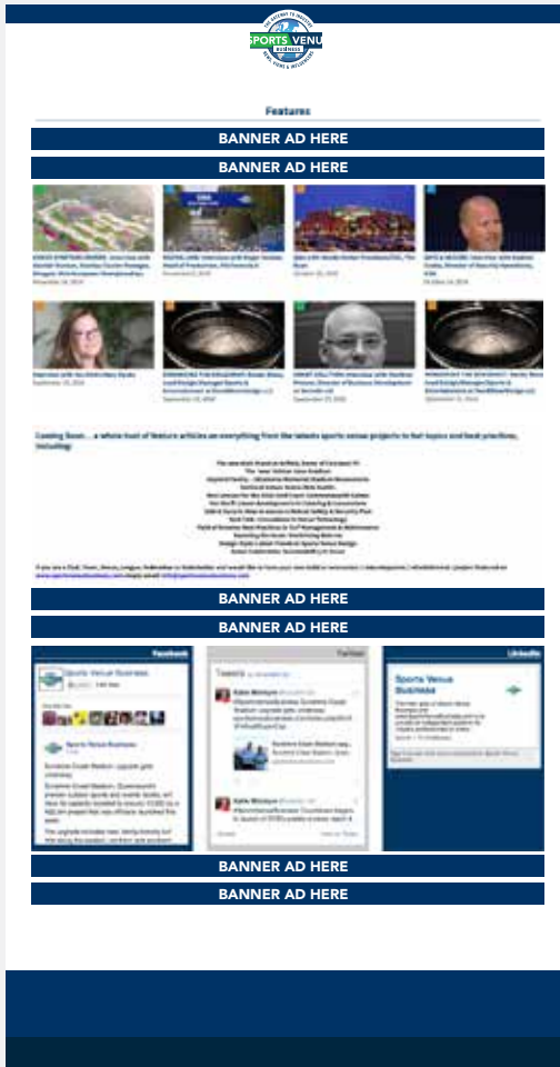
Spec: 1140 X 100px (WxH) JPG or GIF Format, Max File Size: 100kb